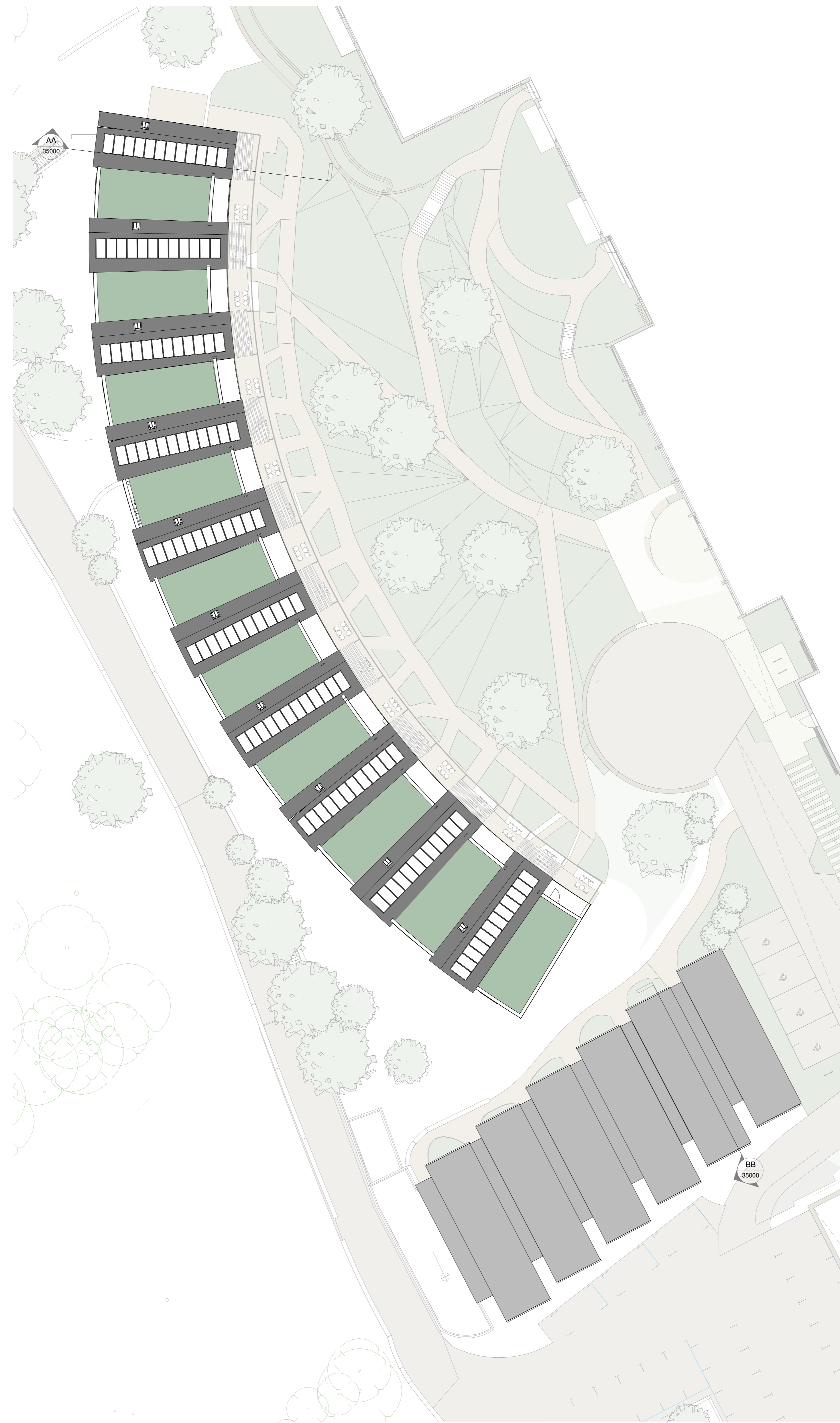
Roof Proposed 1 : 200

Notes Do not scale from this document, unless for the purposes of planning applications where a scale has to be provided. Refer to 'Signed dimensions only'. All dimensions to be checked on site prior to construction. Report all discrepancies or ambiguities to the Document Originator immediately. This document is to be read in conjunction with relevant documents, drawings and standards.